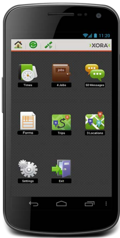
Xora StreetSmart runs on handsets ranging from rugged devices to smartphones and tablets available from our wireless carrier partners.

With the Xora StreetSmart mobile workforce management solution, organizations with employees in the field can instantly see their exact locations, plan their schedules, gather data from the field, and simplify other back-office processes like payroll. As the industry's leading mobile productivity solution, Xora StreetSmart helps more than 16 thousand organizations meet their productivity and service goals for about $1 per day per user.